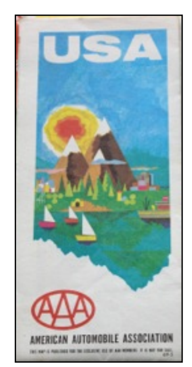
The American Automobile Association (AAA) has been printing USA road maps since 1905